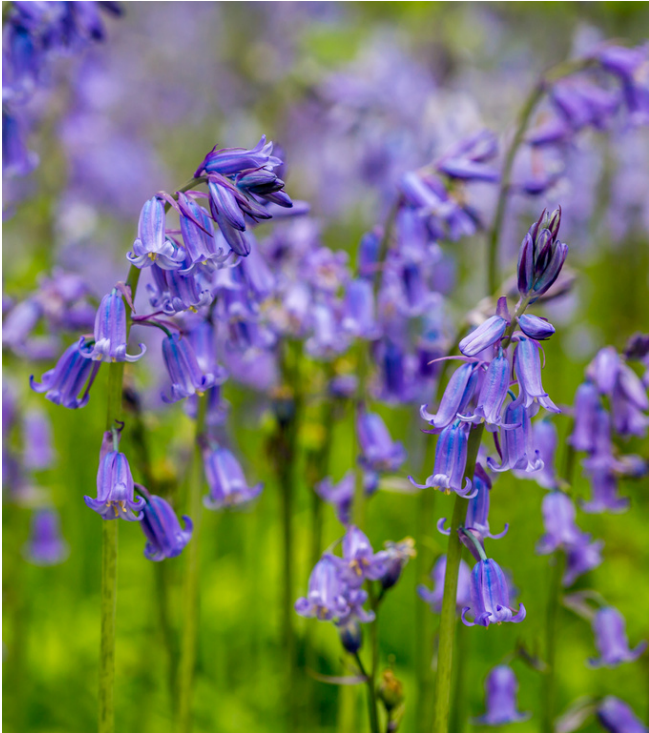
We are excited about the arrival of our Bluebells in April

As we venture into the Summer Term we will once again make sure that our Forest School activities make the most of the transformative energy of the late spring.